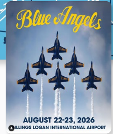
ORGANIC SOCIAL MEDIA: INSTAGRAM